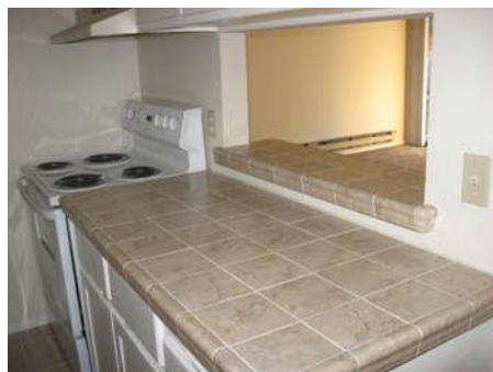
New kitchen counters and stove