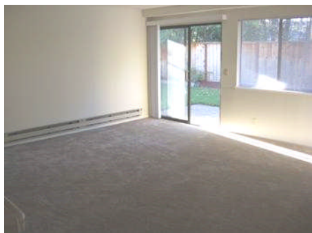
Living/dining combo room

Near parks, schools and shopping. Just off El Camino Real and minutes from downtown Palo Alto, Stanford University and I-280. Downstairs, end unit located in rear of small, 9 unit complex. Fenced-in lawn (new sod) and garden area. Recently updated with new entry tile, kitchen tile, kitchen counters, stove, paint, and wall-to-wall carpet throughout. All appliances currently installed convey, including in-unit clothes washer/dryer.